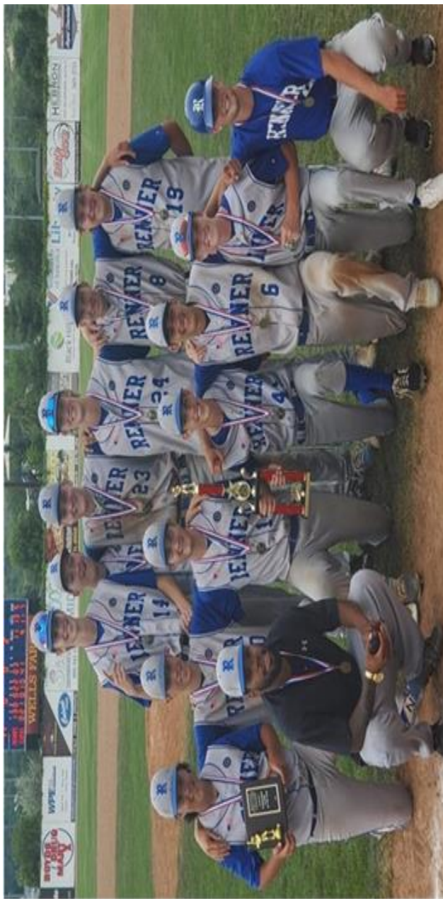
2019 CLASS “A” JR STATE CHAMPIONS Renner Post 307