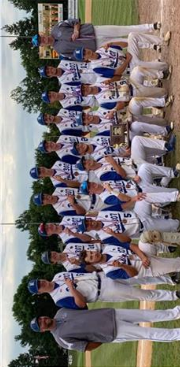
2019 CLASS “A” STATE CHAMPIONS Renner Post 307