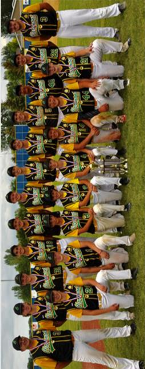
2019 CLASS "B" JR STATE CHAMPIONS CLAREMONT-BRITTON POST 262